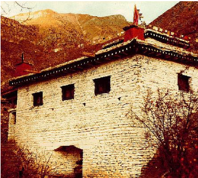
The "Temple Of Miraculous Fire" at Muktinath, Nepal. Photo by Ken Street (Nov. 1979).

[For more on this subject, please read our tract The Temple Of Miraculous Fire .]